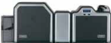
Lamination option and dual-sided printer/encoder

Modular design grows with your needs. Not sure what your ID card applications will require in the future? No problem. The HDP5000 is easily upgraded to fit your needs. Start with a basic single-sided unit. Install encoding modules. Upgrade to dual-sided printing. Add lamination, or simultaneous dual-sided lamination for the ultimate in card security and durability.